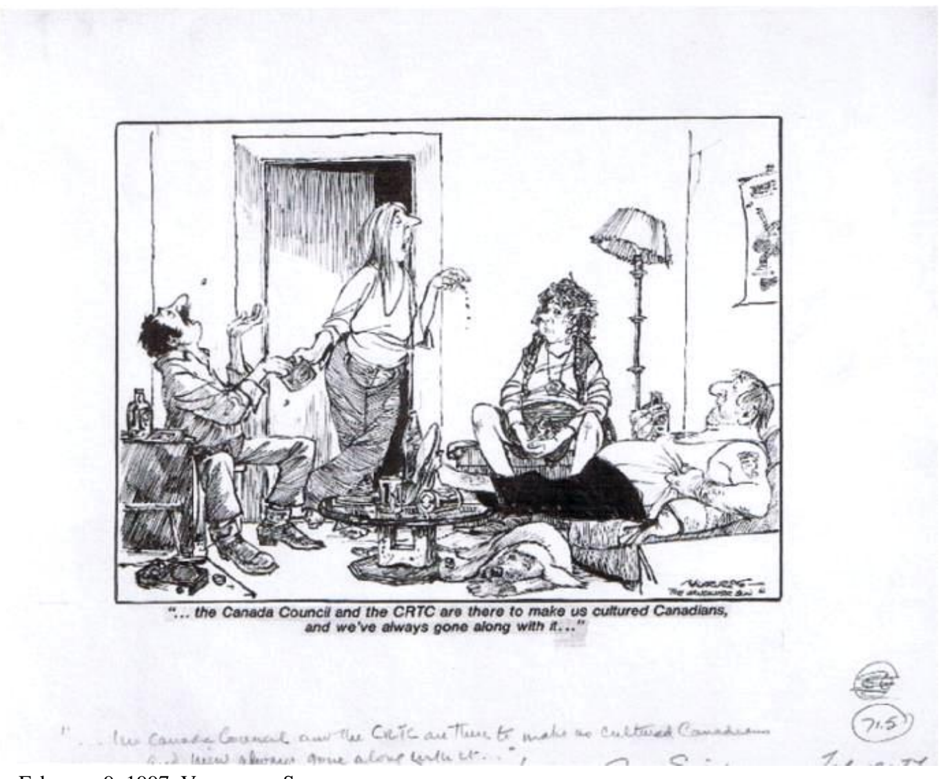
February 9, 1997, Vancouver Sun

Source: Library and Archives Canada, Acc. No. 1988-243-490